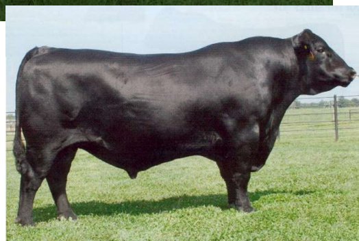
Syngen Trust 6228 - Pai