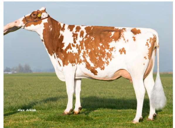
DAM: BATOUWE SALSO AIKO RED-ET VG-85