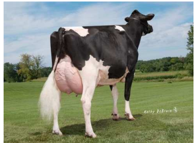
MGD: GOLDEN-OAKS ATWD CHARLA EX-93