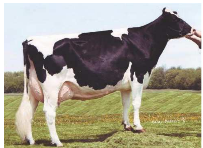
MGGD: GOLDEN-OAKS CHAMP RAE-ET