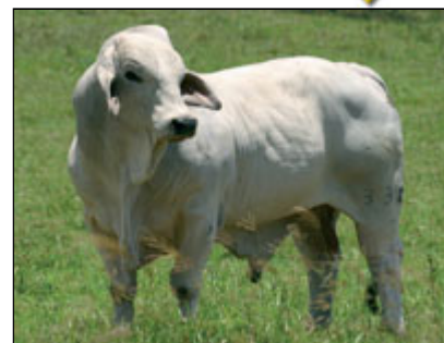
View Larger Image: 89.2kb

Identifier: FGB332M(REG) Sex: Male PH No.: 332 Birth Date: 26/07/2003 Calving Year: 2004 Status: Active Registration Status: Registered Sire: JDH MR WOODMAN MANSO (IMP US) (ET) Dam: FBC F JESSE KATE MANSO 226FF (AI) (ET) (H) GeneStar® Marbling: Marbling (M1-0,M2-2,M3-0) Total of 2 favourable genes GeneStar® Tenderness: Tenderness (T1-1,T2-0,T3-0,T4-0) Total of 1 favourable genes Feed Efficiency (FE1-2,FE2-2,FE3-2,FE4-2) Total of 8 favourable genes Breeder: PB FENECH Current Owner: Multiply Owned Horn: Horned Colour: Grey Pompe Status: Bred Free Progeny: [124 - View] [View by Herd] Pedigree: [View]