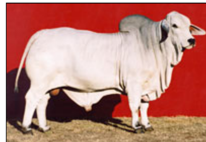
View Larger Image: 54.3kb

Identifier: ELR3981M(REG) Sex: Male PH No.: 3981 Birth Date: 15/12/2003 Calving Year: 2004 Status: Active Registration Status: Registered Sire: LANCEFIELD SIGNATURE 9153 (AI) (ET) (H) Dam: ELROSE GHOST GUM 6TH (AI) (ET) (H) GeneStar® Marbling: Marbling (M1-0,M2-2) Total of 2 favourable genes GeneStar® Tenderness: Tenderness (T1-0,T2-0) Total of 0 favourable genes Breeder: RG & LD JEFFERIS Current Owner: RG & LD JEFFERIS Horn: Scurred Colour: Grey Pompe Status: Tested Free Progeny: [116 - View] [View by Herd] Pedigree: [View]